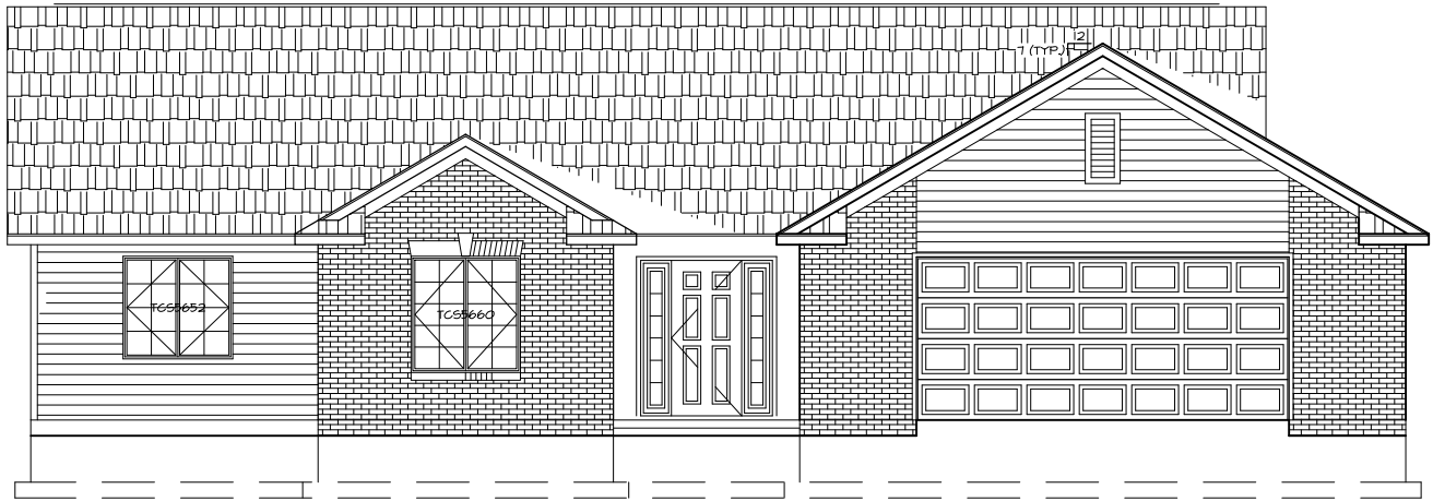
1 NORTH ELEVATION A-1